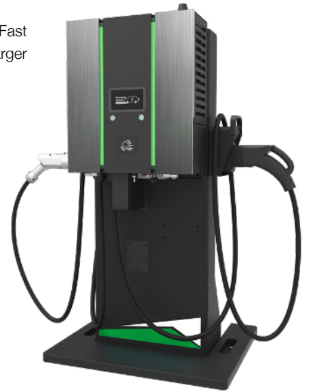
30kW DC Fast EV Charger

The new TurboEVC Level 3 DC Fast Chargers facilitate convenient charging of all electric vehicle models, including those with high voltage battery systems. TurboEVC DC Fast Chargers are ideal for applications needing to serve the public and fleets, including cars, buses, and trucks. Because of its modularity, TurboEVC can offer charging capability up to 120kW and serve two electric vehicles at once. TurboEVC is ideal for locations looking to add the benefit of electric vehicle charging, including retailers, fueling stations, convenience stores, and logistics companies.