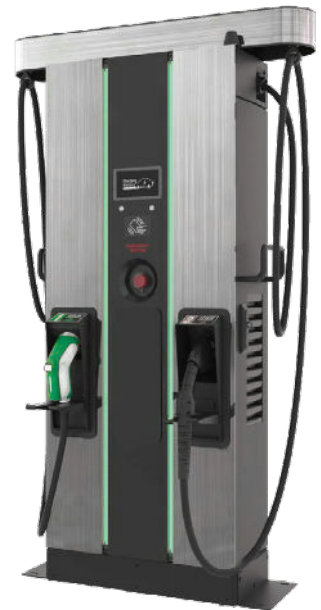
60kW DC Fast EV Charger

TurboEVC DC Fast Chargers come with a standard 7" LCD screen that allows drivers simplified interaction with the charger. Each unit can include up to two connection types that can fast charge a vehicle up to 80% in 30 minutes. Charging units can be installed into your existing architecture with cable management systems that provide the appropriate reach while keeping cables off the ground.