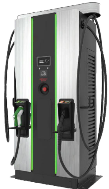
120kW DC Fast EV Charger

Electric vehicle chargers can only be as good as the technology backing them up. With TurboEVC Level 3 DC Fast Chargers, you'll have a network operating system that supports all charging applications with Ethernet, 4G, and WiFi. Station owners can customize stations to meet their specific requirements, including setting price policies for public use or making stations available for fleet operators only. Users can interact with the unit using a secure RFID card interface or mobile app that can tie everything together, including payment management, reporting, and third-party mapping.